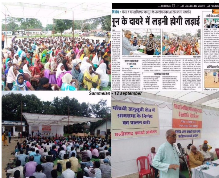
Public meetings for PESA implementation in Korba district, Chhattisgarh

around the (elephant) sanctuary will block at least 40 million tonne per annum of coal production, the state government allowed for mining in these areas as well, violating its own commitment to address the growing concerns. In Korba district, a significant campaign has been waged over these questions in the past few months. On 12th February, a public meeting demonstration was organised at Morga in Podi Uproda block by members of Hasdeo Aranya Bachao Sangharsh Samiti and Chhattisgarh Bachao Andolan. Villagers have locally rejected the increasing illegal mining and said that it is because of these mining activities that elephants have started migrating into populated areas. A memorandum of demands was submitted through the deputy ranger of the forest department to the district collector. In the meeting it was shared that in the past two weeks alone 5 people have been killed and two dozen houses have been destroyed in Hasdeo area. They also raised questions on the preparedness in dealing with these attacks and their apathetic responses to the problems faced by the people.