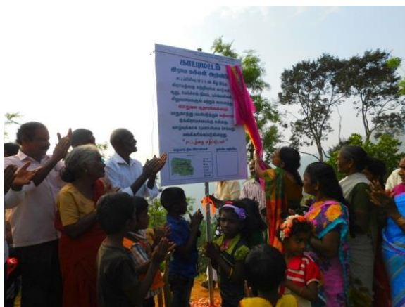
Declaring self-rule in two villages – Devil Atti, Kattimattam, Tamil Nadu on 10 th December 2017

Bihar -Mazdoor Kisan Samiti organized a special series of awareness building among the communities and panchayat representatives on Targeted public distribution system and especially for Mahadalit communities in Bihar. Scholarships for students from the Mahadalit communities and forest rights as provisioned in Forest rights act who have been residing in the forest and Mukhyamantri housing scheme applicable in the state. The series started from 17th July to 23 rd July in Barachatti and Fatehpur Blocks of Gaya district. 8 such meetings held and covered 10 villages and reached out to around 1200 families.