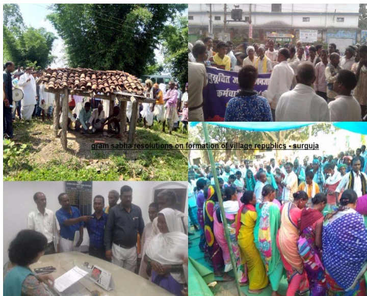
Gram sabha meetings for passing of self-rule, Formation of Gaon Ganrajya Sarkar in Chhattisgarh

This has reduced police harassment on tribals and minorities in the region and has developed a more inclusive mechanism of grievance redressal. Village republics have also empowered the people to assert for the recognition of their rights at state level as well. One case in point is the fraudulent SECL mining in the third phase of MAHAN project which did not take free and