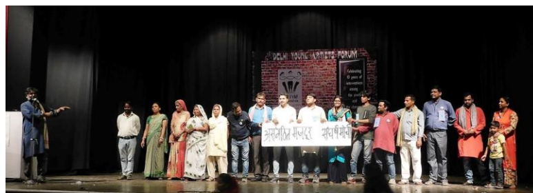
Annual Convention of Delhi Young Artists Forum, 29 th March, Delhi

Delhi - Volunteers of the Delhi Young Artist Forum (DYAF) undertook a school admission campaign in which they identified 194 dropout members. Following the completion of class 8 th , many students drop out either due to lack of financial or other support from their families, and to get involved with working to earn incomes. Young girls are the most affected also due to existing societal biases. In absence of support, parents do not invest time or resource on their education, and entrust them to take care of household chores or other members of the family. Due to the breaking out of fire at Bawana on 12 th April which gutted almost 500 houses and damaged many houses