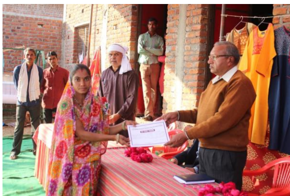
Two-month training for weavers at Adarsh Hatkargha, Rajasthan; Certificate giving ceremony for 20 trainees