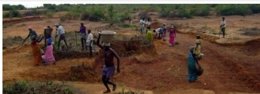
Land development for horticulture under MGNREGA