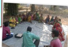
Meetings of Kendu leaf pluckers

for and under FRA processes that helped securing community and individual forest rights. Apart from planning for village developments and decisions over entitlements, the gram sabhas could also settle numbers of grievances in the area. Resource centres were also established in the field areas of the SRUTI blocks. This is further helping in knowledge and perspective building on around the issue. A community network and liaison with administrative bodies were also strengthened by organizing various meetings, sharing and laborative programs through the year.