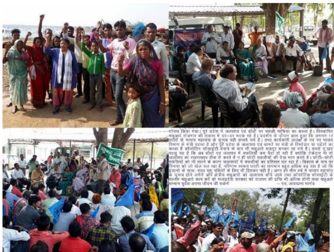
Narmada Yatra, Madhya Pradesh

which come under the catchment area of Machogara Dam. These villages lack basic facilities with no employment opportunities for people.