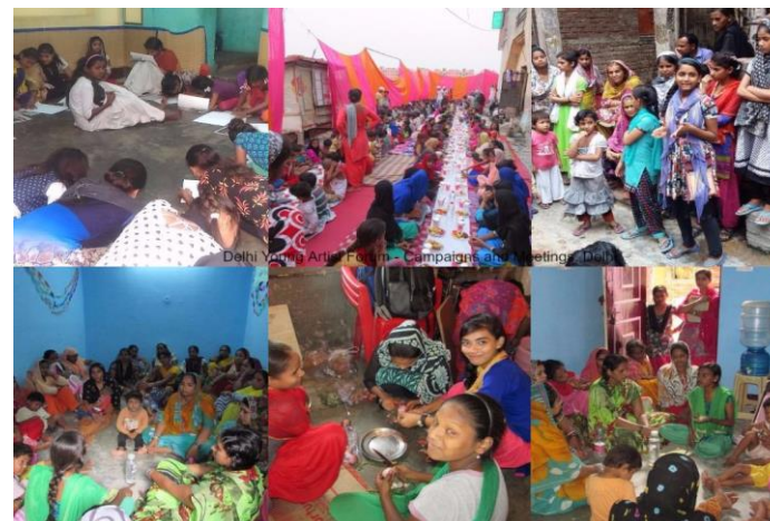
Delhi Young Artist Forum (DYAF) organizing cultural programs and community celebrations of festivals

Delhi - Several cultural programmes, community celebration of festivals, painting, crafts and art competitions were organised as activities to foster better friendships and cooperation. Interactions with university students through visits also allowed them to build a better understanding of teaching methods, helping individual students to dream of going to these universities one day, and be able to realise their dreams for themselves and their families. The conditions in the resettlement colonies reflect the long-ignored dreams of many in the young populations, and to continue to