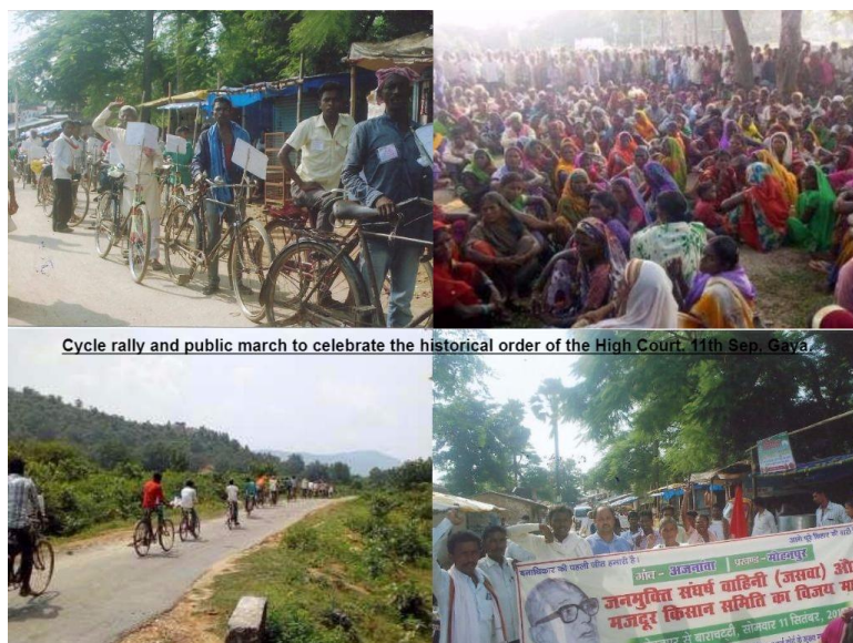
Cycle rally and public march to celebrate the historical order of the High Court, 11th Sep, Gaya

Odisha -In terms of claims under the FRA, radical steps have been taken by Government of Odisha which had issued an order in 2013 for giving title of record of rights of the people residing in revenue forest. But this was not worked upon. Recently, verification has been completed for 1456 people in Kanakdahad block who had filed for claim for forest rights. Among them 3200 applicants have been included in the register for grant of record of rights. 576 people who were missed out, the process of filing application form have been going on in Kankadahad block.