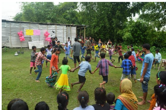
Children playing in relief camps in Barpeta district, Assam

In Bihar emergency relief services was provided to the flood affected 500 people (100 Households) in Nirmali block of Supaul district by Gyan Sewa Bharti Sansthan with the help of SRUTI. Need assessment based on means of livelihood of the households and extent of loss due to flood. In this way, we assessed 100 households. Delivery of relief materials started on 9th October 2017. SRUTI also helped Nav Jagriti to distribute 4000 hygiene kits in the flood affected areas like Katihar, Khagaria and Sithamarhi.