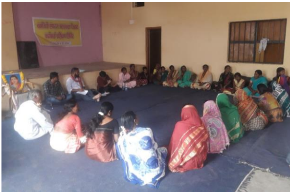
Leadership building training with women sangathan members, 1 st Nov, Latur dt, Maharashtra

Uttarakhand - MATI has been working to eradicate alcoholism, raise issues in management of van panchayats, increase livelihood opportunities and provide trainings on local self-government and the proper implementation of social welfare schemes. In their work against liquor mafias following which they had faced false cases against some of the karyakartas. After six years on 26 July 2017 the case was proved false and the court dismissed the case. Celebrating this victory there was a meeting organized on 6 th September 2017 by the sangathan at Almora. There the history of the whole movement was recalled; how they had started the movement against liquor mafia, the problems they faced, how govt. and mafia tortured and filed false cases against them. Later a memorandum with demands of closure of the sale of liquor and other demands were sent to the CM of Uttarakhand. There were 3 more village level meetings were conducted for spreading awareness regarding impact of liquor. addressing violence. Four individual cases were addressed and through meetings awareness was spread among people.