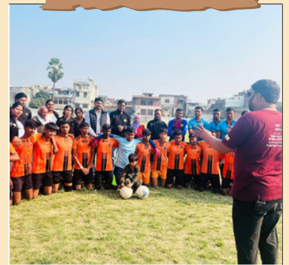
Spreading the message of harmony through Aman trophy tournament