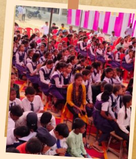
Dialogues in school