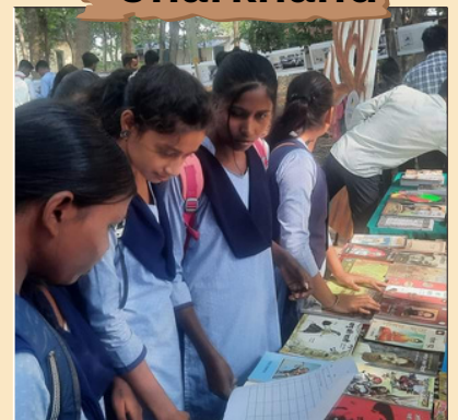
Mobile library to enhance the knowledge on Constitution