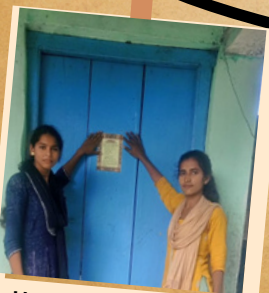
Har Ghar Samvidhan Campaign