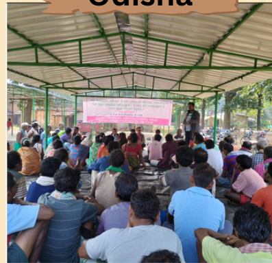
Establishing dialogues through awareness meeting