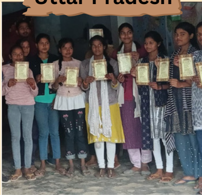
Engagement with youth through 'Har Ghar Samvidhan'