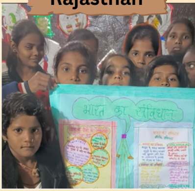
Poster activity with the adolescent girls of Adharshila