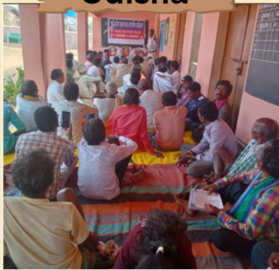
Convention on Constitutional values by Zindabad Sangathan