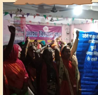
'Women and Constitution' workshop with women laborer