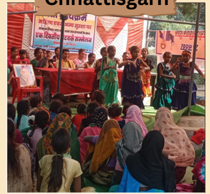
Event celebration with tribal community women