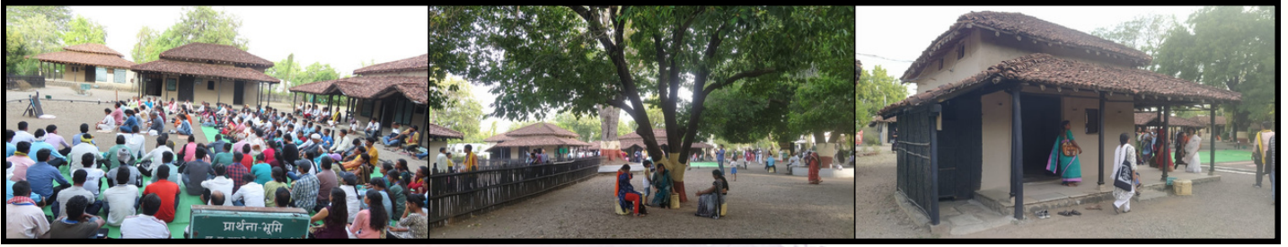
Gathered in the evening for a walk around the campus of Bapu Kutli, Sevagram, and participating in the evening prayer at the campus, which to date has preserved and documented the life and spirit of Mahatma Gandhi.